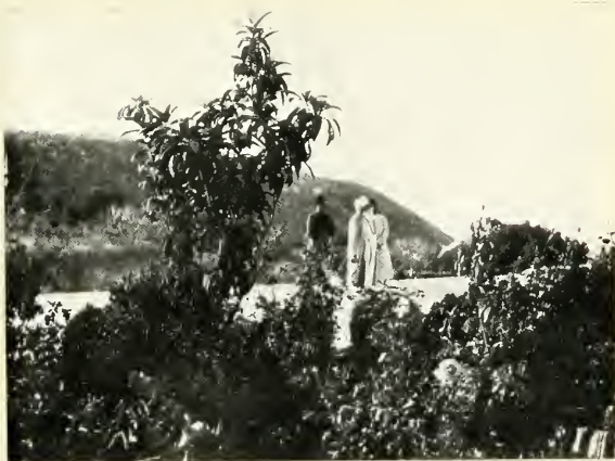
ABDUL BAHÁ WALKING ON THE TERRACE BEFORE THE TOMB OF THE Báb—THE PROMONTORY OF MOUNT CARMEL IS IN THE DISTANCE